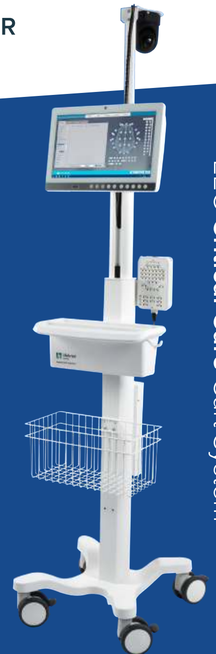
EEG Critical Care Cart System

Designed and built for use in the NICU, ICU and ER where space is limited.