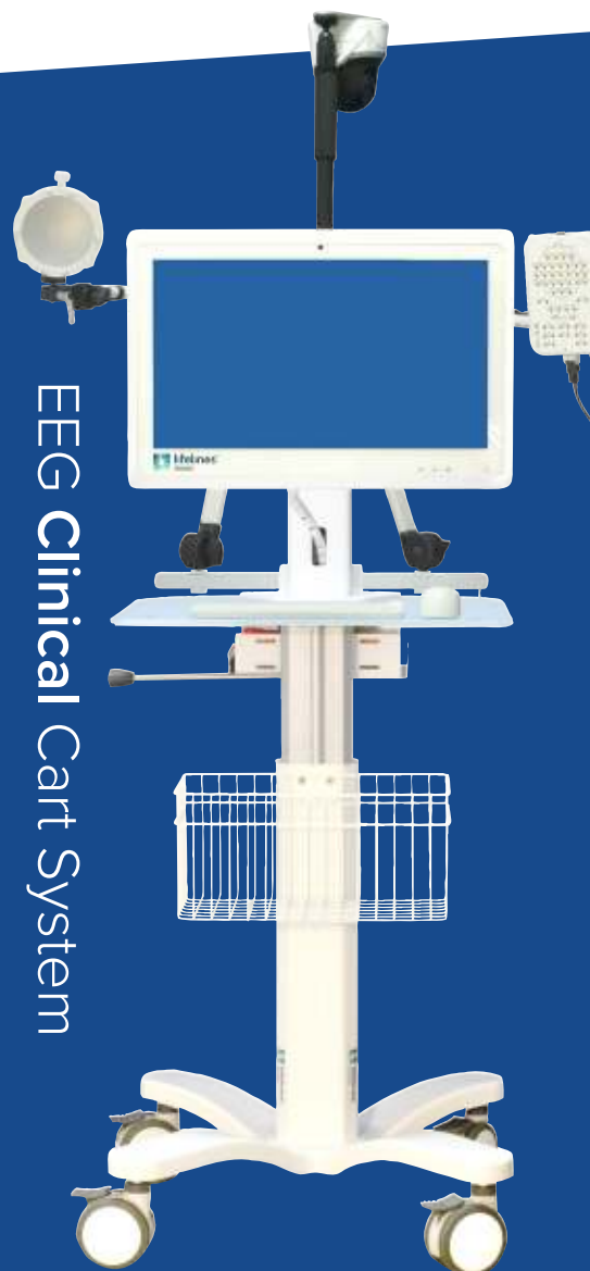
EEG Clinical Cart System

Rugged and versatile, and easily adjusted for comfortable use anywhere.